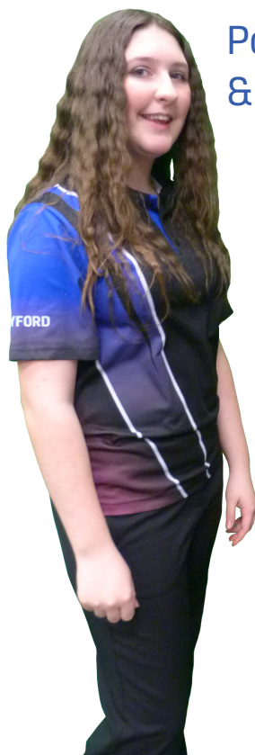
Polo Shirt & Trousers