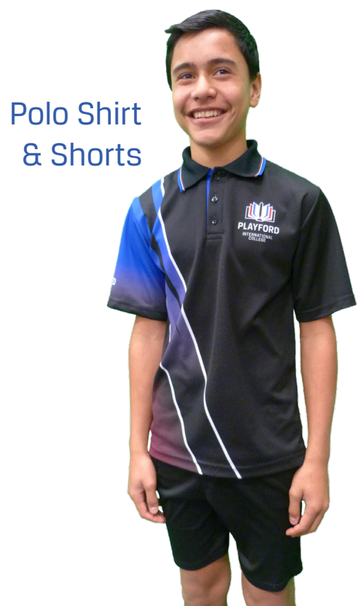
Polo Shirt & Shorts